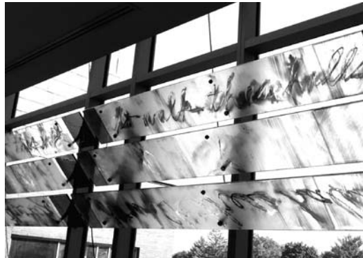
To Cross this Passage by Stuart Reid

So form the lines of text adorning a recent work by internationally recognized architectural glass artist and Faculty of Design Professor Stuart Reid. To Cross this Passage is made of 72 glass louvres suspended from the windowed walls of the new Bloorview Kids Rehab – a facility dedicated to healing in children with disabling injuries and illnesses and congenital disabilities.