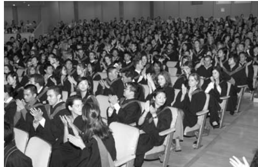
OCAD's graduating class of Spring 2007 at Roy Thomson Hall.